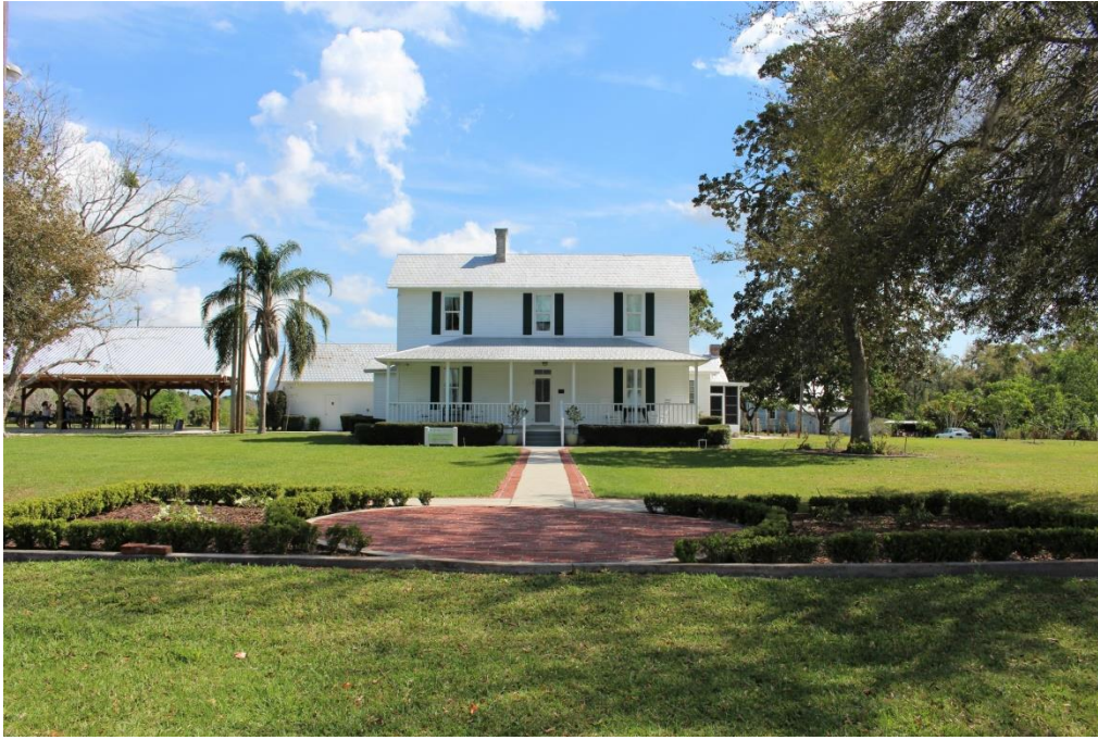
HISTORIC 19 TH CENTURY HOMESTEAD, GROVE, AND VENUE ON THE INDIAN RIVER