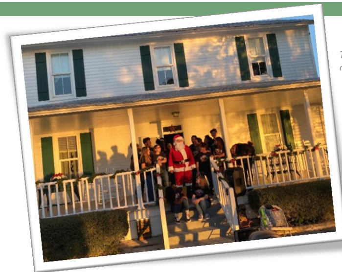
The Cocoa High School Chorus and Santa Claus at Field Manor.