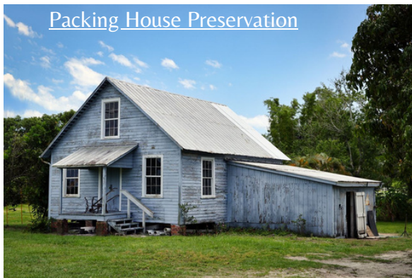
Packing House Preservation

Our Packing House has taken a bit of hit with the last two storms. Consider a donation toward its preservation by clicking the photo above.