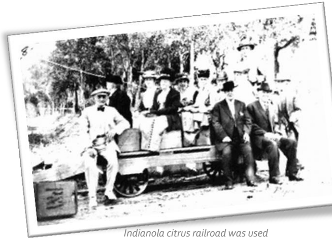
Indianola citrus railroad was used to move fruit to the docks and transportation through the groves