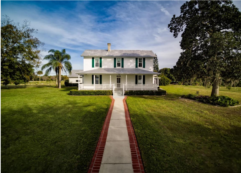
HISTORIC 19 TH CENTURY HOMESTEAD, GROVE, AND VENUE ON THE INDIAN RIVER